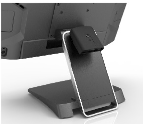
Arm type Barcode Scanner