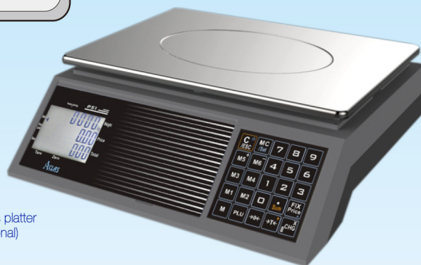
Stainless platter (optional)