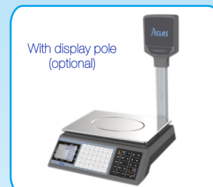
With display pole (optional)