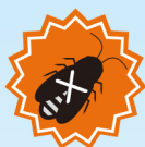
Patent insect-proof design