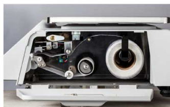
Optional Linerless Label Printing