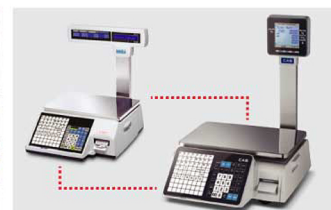
CL Series Compatible