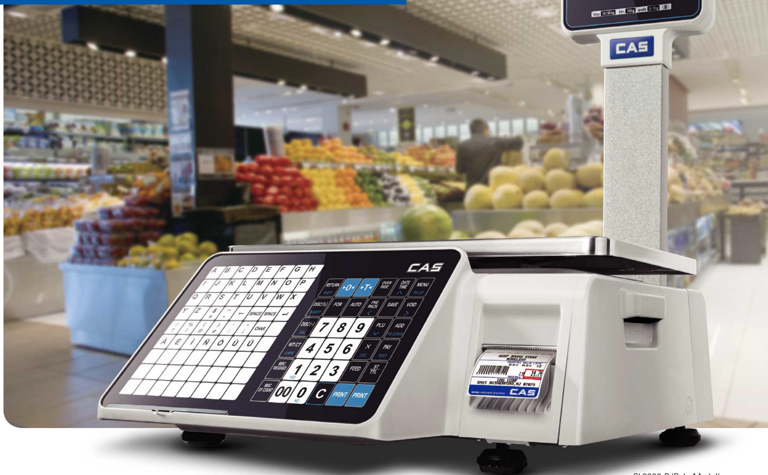
CL3000-P (Pole Model)