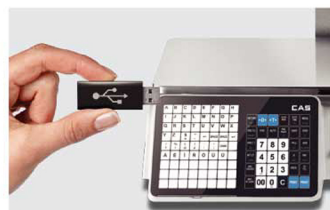
Firmware Update via USB Flash Drive