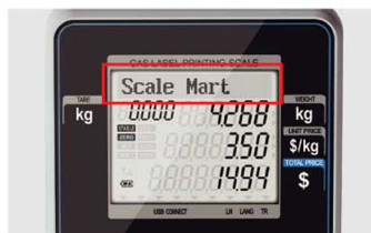
Scrolling Message Bar