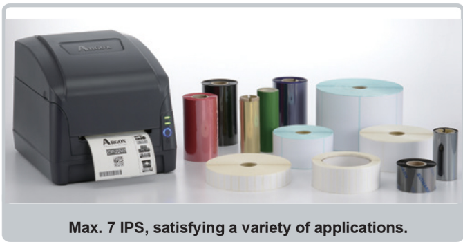
Max. 7 IPS, satisfying a variety of applications.